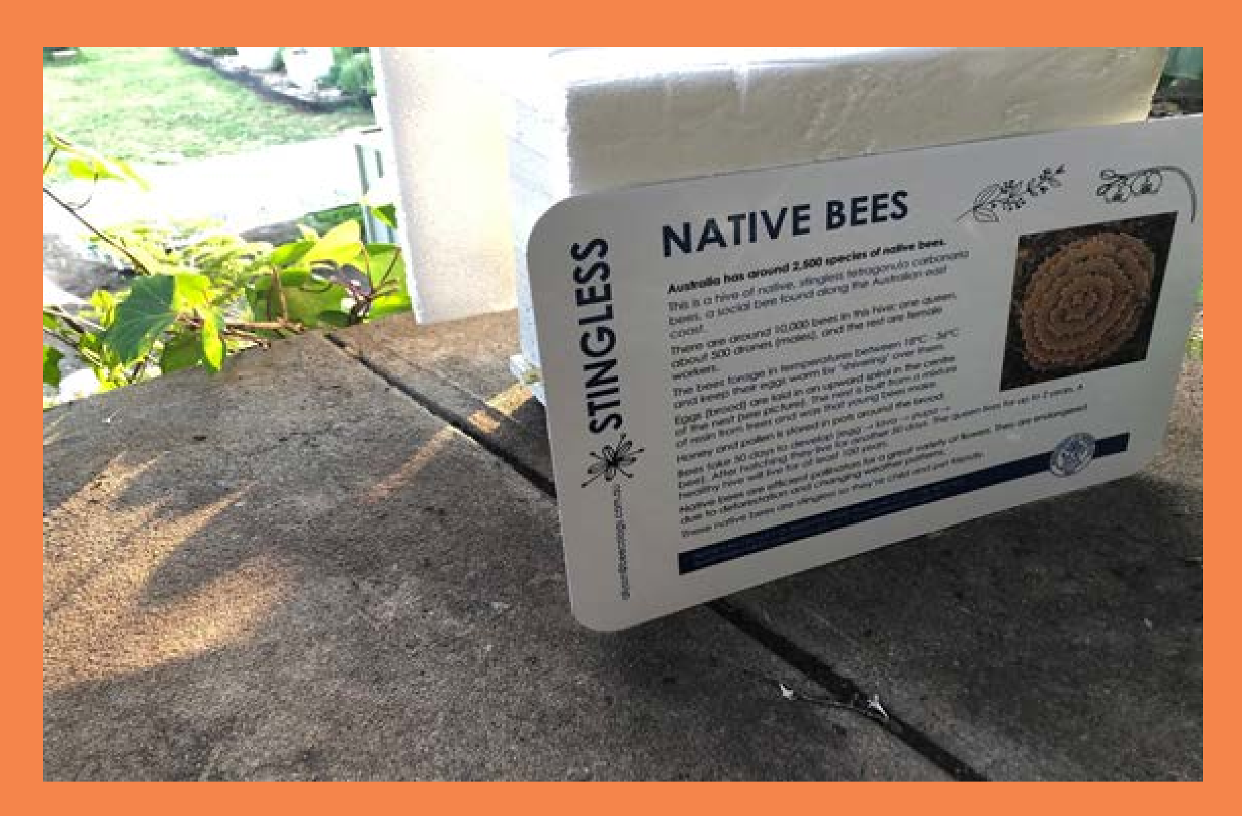
Henley Green hosts a hive of Native Stingless Bees to improve pollination across Hunters Hill