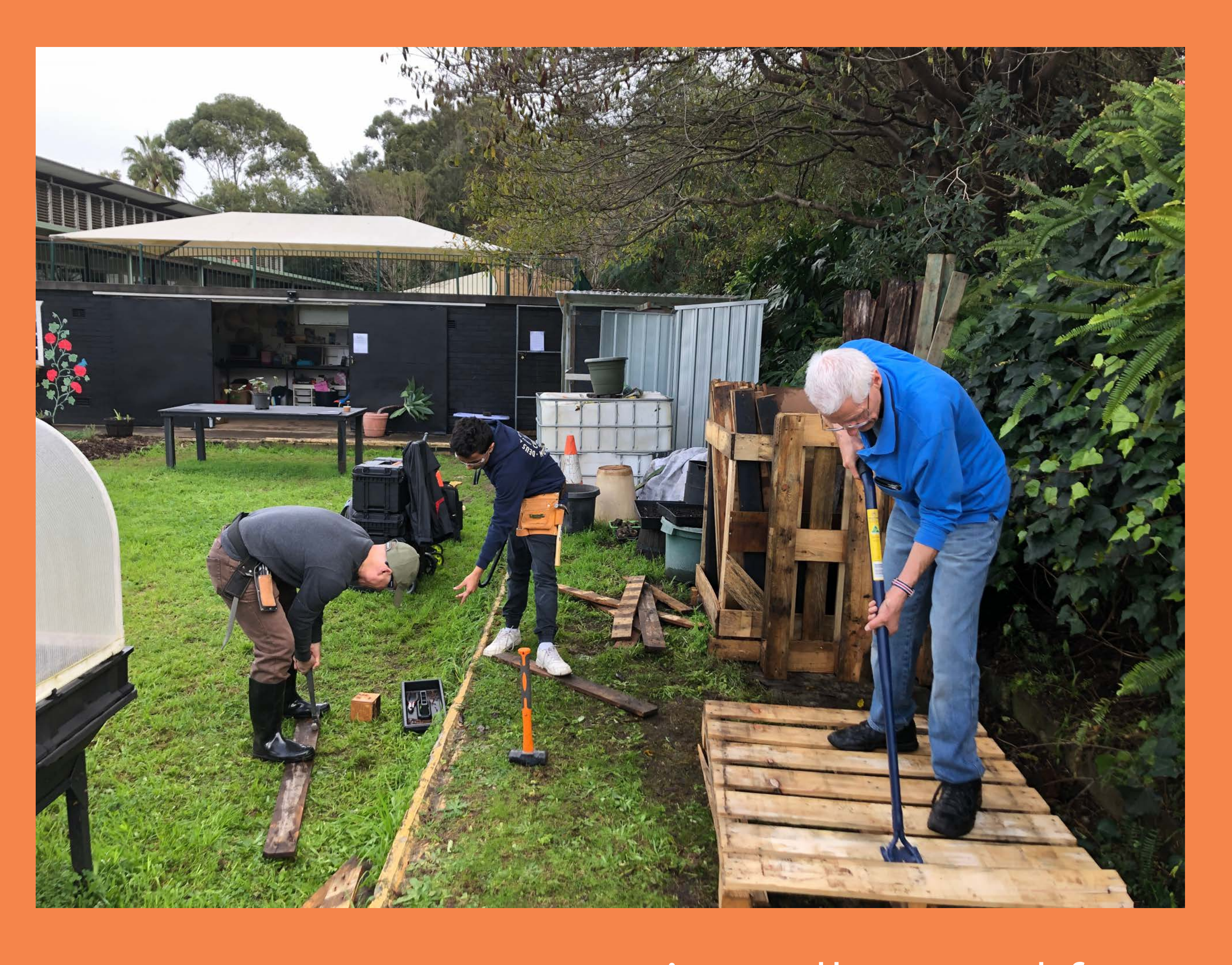
Our Hen Men reusing pallet wood for use in the garden